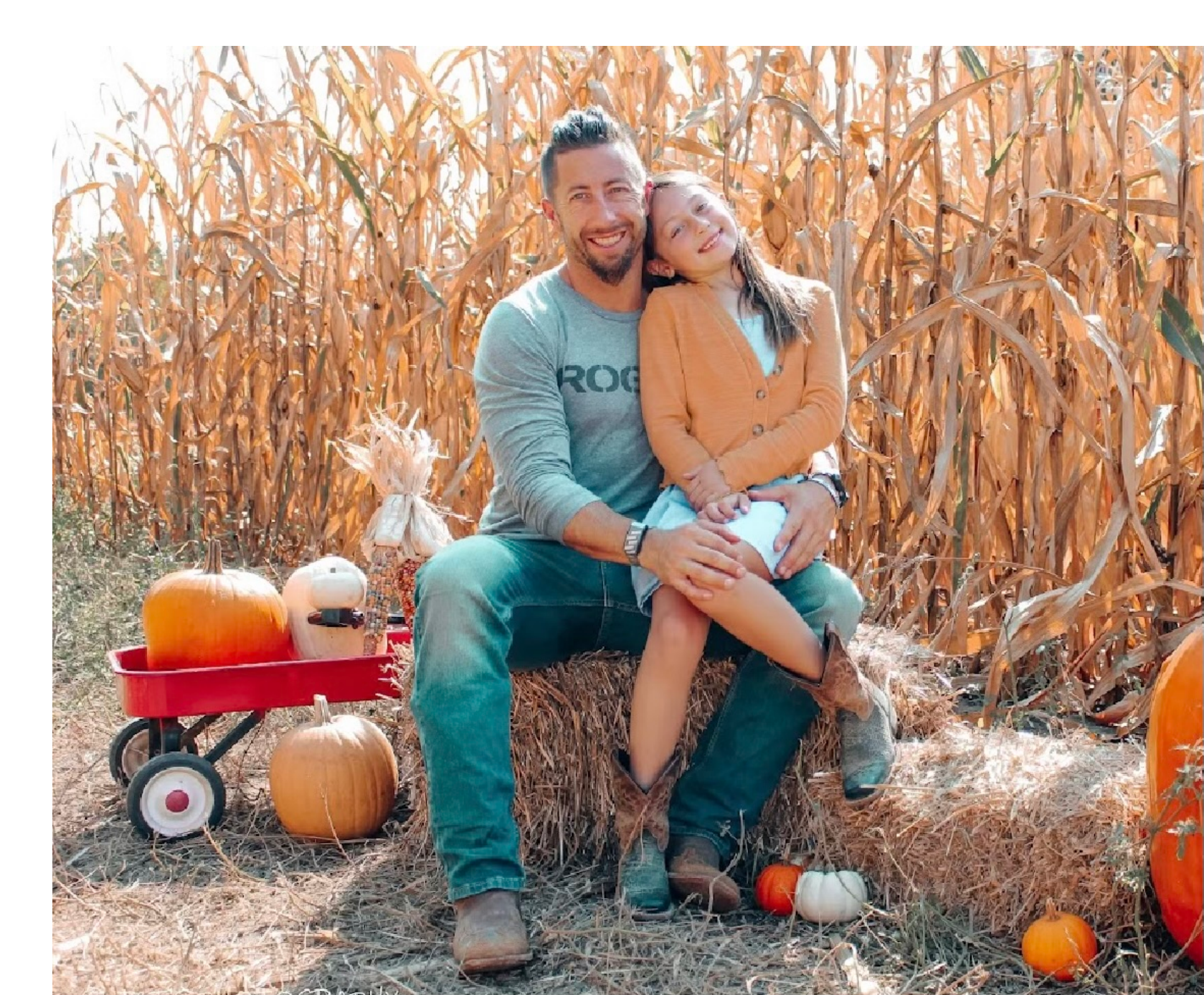
This is their fall picture

After spending time with Murph, the girls spend time with their dad.