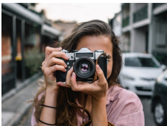
Photo a Day Challenge

Milton PUBLIC LIBRARY ONE MINUTE FILM COMPETITION